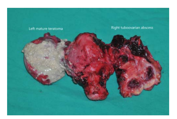
Figure 2: The gross specimen showed a right tubo-ovarian abscess, a left mature teratoma, and normal uterine cervix

The severe adhesion was lysis by the hydrodissection technique with the infiltration of sterile water between the serosal surface of the uterus, both adnexae, and the rectum. The uterus and both adnexae were steps for the removal of the laparoscope with minimal blood loss of 50 mL. The heparin was restarted for infusion at 48 hours following the post-operative