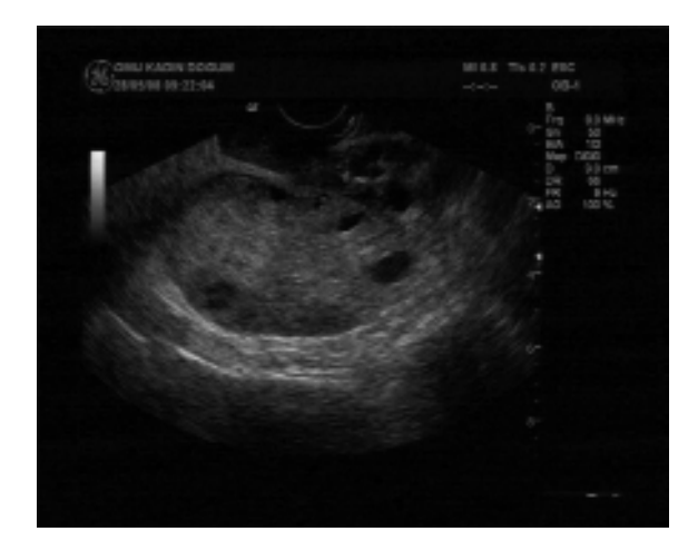
Figure 3: Transabdominal ultrasound image of twisted normal adnexa in 18 year old girl. The ovary is enlarged and containing small follicüles in its periphery.

gangrenous, hemorrhagic and necrotic, twisted two times around its pedicle. After deciding that the right ovary was nonviable, right salpingo-oopherectomy was performed and final pathologic analysis revealed hemorrhagic infarction of the normal ovary and oviduct.