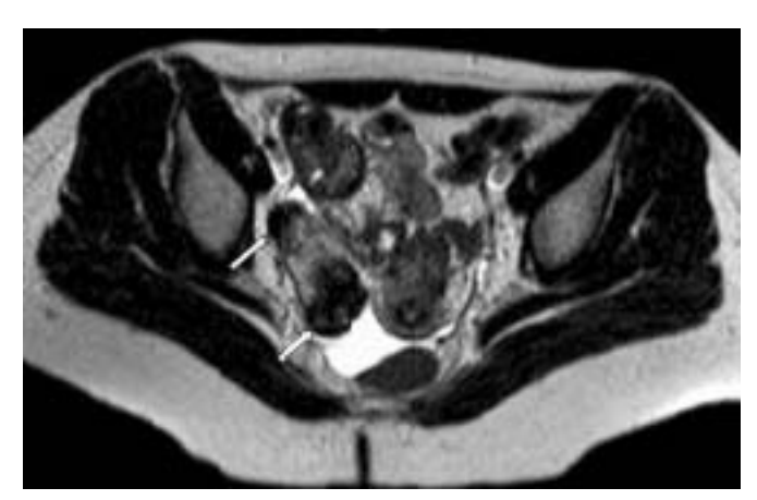
Figure 1: Axial T2-weighted MR image shows two ovarian well defined lesions (arrows; anterior 18x18 mm, posterior 34x25 mm) with very low signal intensity, a finding that is suggestive of an ovarian fibroma

and microscopic examination of the mass had no finding of inflammation or abscess, microscopic examination showed an ovarian fibroma, (Figure 2). She is now in the sixth postoperative month and still has no fever.