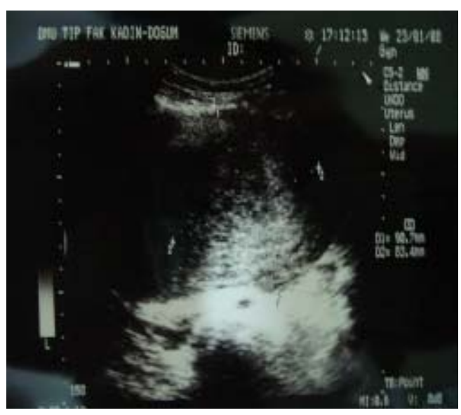
Figure 1: USG image.

dominal discomfort and distension. The patient was gravida 1 and para 1. Ultrasonographic examination revealed a 90x83 mm sized mixed echoic pelvic mass located at the posterior of uterus (Figure 1). With an exception of high CA125 level of 63 IU/ml (cut-off is 35), the other serum laboratory findings were in normal ranges. She had not any history of familial or chronic diseases and she had a C-section six years ago. A laparotomy was performed and uterus, bilateral tuba uterina and ovaries observed as normal. A 20x25 cm sized, creamy coffee colored, solid natured, lobulated, hard mass was located at the paraumbilical region, bound to anterior abdominal via a thin pedicle. The pedicle was clemped and mass was removed for pathological evaluation. Patological examination was reported as abdominal desmoid tumor (Figure 2). One year follow-up of the patient after the surgery was completely normal.