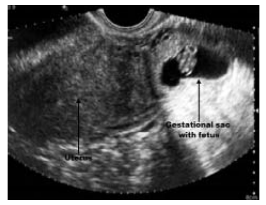
Figure 1. Transvaginal ultrasonography showing right tubal gestational sac involving fetus with a gestational age of 7 weeks and 6 days (crown–rump length of the fetus was 14 mm)

tion confirmed preoperative diagnosis (Figure 3). However, recanalization or fistula could not be demonstrated microscopically. The patient was discharged from hospital after an uneventful postoperative course of 24 hours and she is free of any symptoms 6 weeks after the operation.