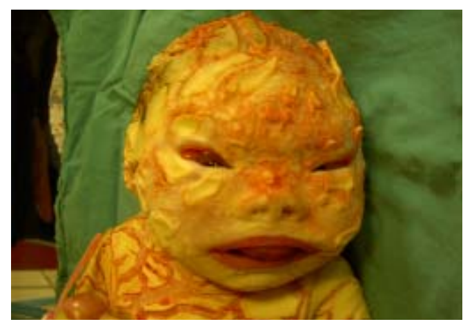
Figure 2: facial features of HI