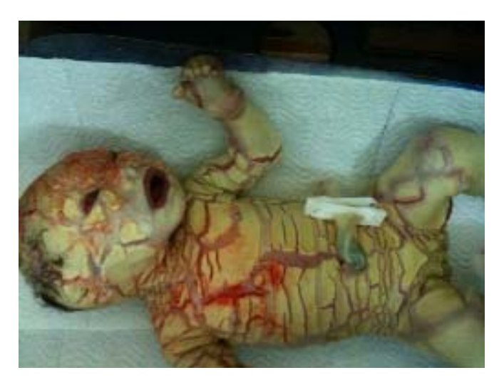
Figure 1: skin features of HI

there were fissures and map like plates on fetal head skin. Limited ultrasonographic examination (amniotic fluid index, fetal biometry, fetal cardiac activity, fetal presentation, placental position was noted) was normal except polyhydramniosis. Prepartum diagnosis of this condition could not be made. Fetus was externally monitorised. At the 15th minute of NST examination, late decelerations and abnormal vaginal bleeding began. Patient was delivered with cessarian section and a baby was born with harlequin ichtyosis. The female baby was born alive at the 36<sup>th</sup> week of the mother's third pregnancy, her birth weight was 3000g and her length was 50 cm. Baby was handed over to paediatrician. It was covered with thick, hard armour like plates of cornifed skin separated by deep fissures (figure 1). The infant had characteristic features typical for HI; ectropion, eclabion, a distorted, flattened nose and low set dysplastic ears (figure 2). There was flexion deformity of all joints of the limbs (figure 3).